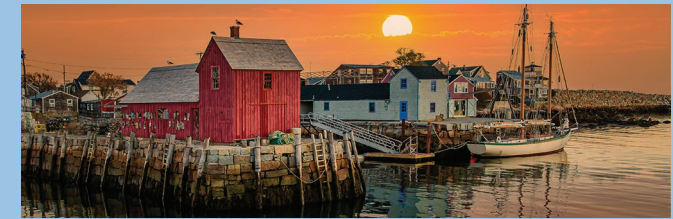
Motif No. 1

Only an hour north of Boston by car or train, and at the heart of the Essex Coastal Scenic Byway, Rockport is the perfect destination for relaxation and inspiration. Full of intriguing history, unmatched beauty and serenity, Rockport invites you to slow down and be renewed.